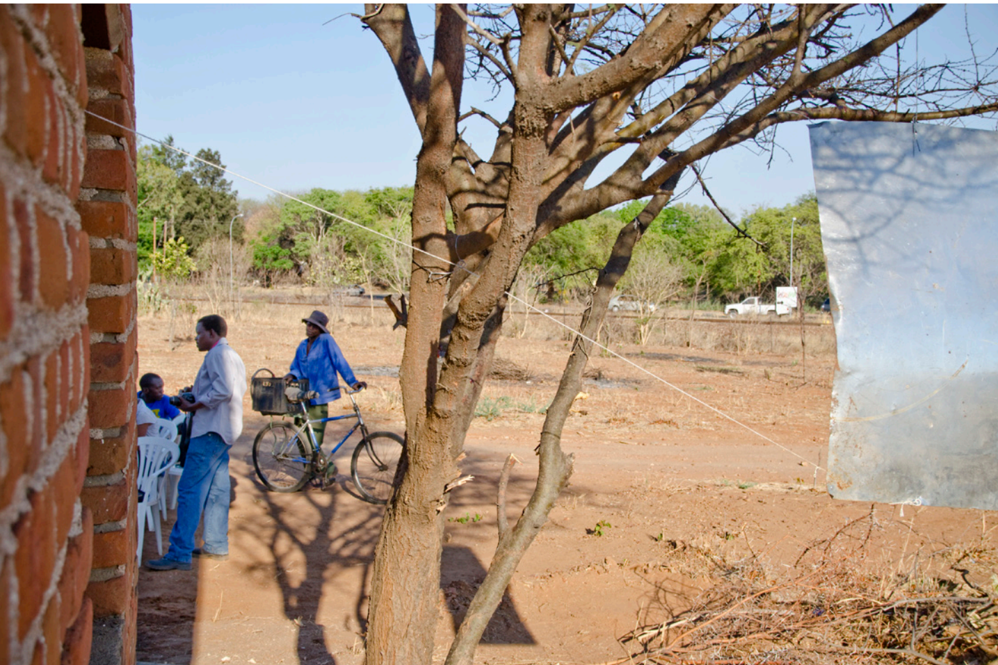
OFF SPACE j.w.d. (transferred from Berlin to Francistown) temporary Installation at the Hexagonal Building Francistown, Botswana 2013

Three sheets to the wind A sound installation made of found material