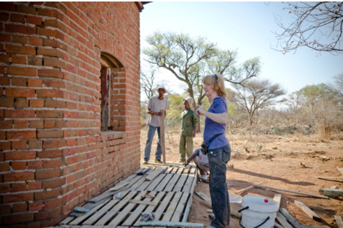
OFF SPACE j.w.d. (transferred from Berlin to Francistown) temporary Installation at the Hexagonal Building Francistown, Botswana 2013