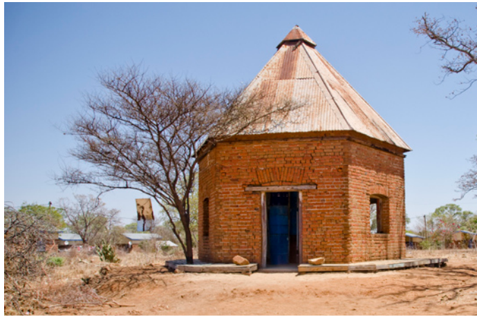
OFF SPACE j.w.d. Opening on the 8th of October 2013