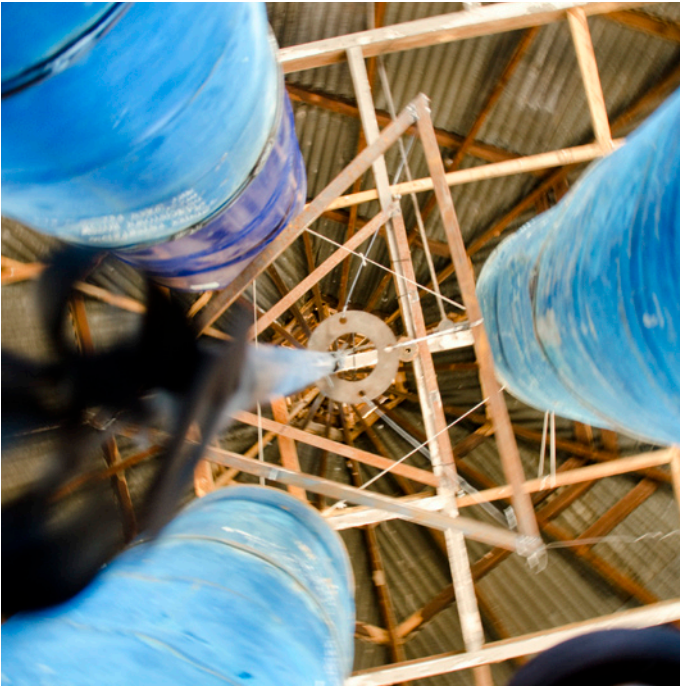
3 columns out of drums welded together 2 triangular steel frames, a tube, strings and diverse soundmaterials inside the drums, 3 iron sheets outside the hexagonal building